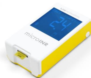
Figure 1. microINR

The microINR system is intended for the quantitative determination of PT (INR). The microINR meter (figure 1) and the disposable analytical microINR test chips compose the microINR portable coagulometer. The product is intended for professional use, self-testing and self-management of patients on oral vitamin K antagonist therapy.